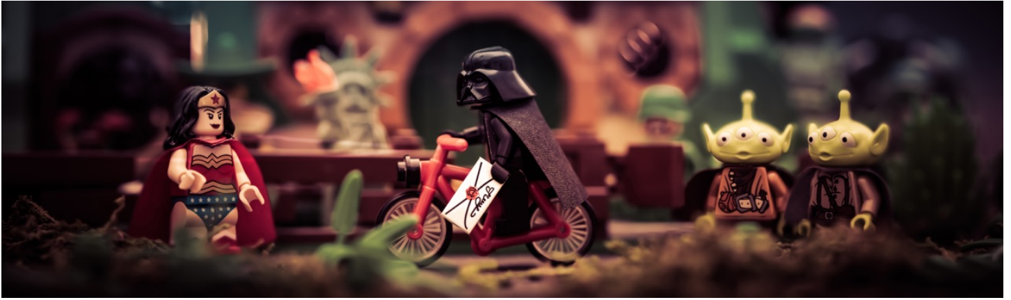
Boris Vanrillaer, @_Me2_, The Dark Knight™ , Metallic Paper on Plexi, 2013